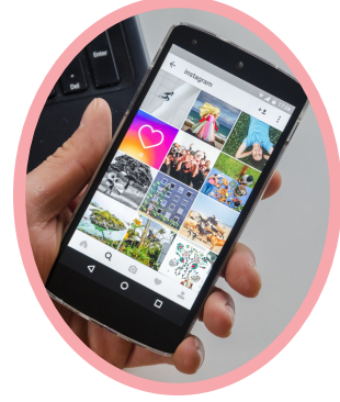
Need some inspiration? This toolkit includes posts you can use to get started!